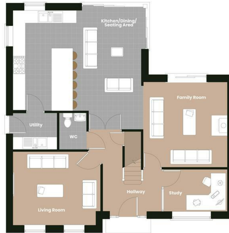
Ground Floor Plan - Plot 3